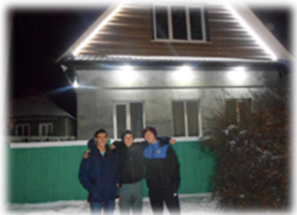
Picture of the House of Grace

My favorite Christmas tradition is spending time cooking cherry vareniki with my mom for Christmas dinner. My family does not go to church on Christmas. Instead, we visit my godparents to celebrate, spend time together, and give and receive gifts. My favorite thing about Ukrainian Christmas is spending time with family and friends, listening to Christmas music, and of course...THE FOOD.